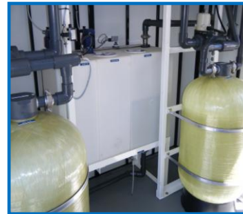
MEDIA FILTER & CHEMICAL INJECTION SYSTEMS