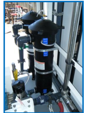
20&5 MICRON FILTERS