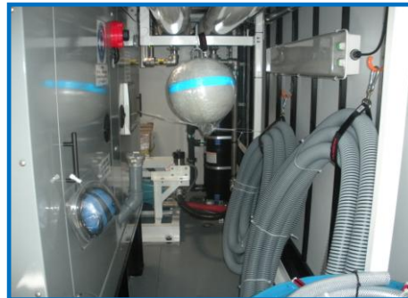
GENERATOR WITH HOSES