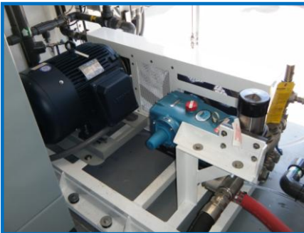
PUMP AND MOTOR